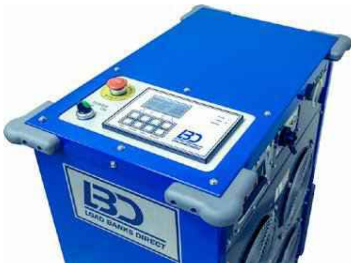
125KW Portable with top mounted Controller

Data Logger Access, Fault Diagnostics and Custom Configuration Setup are available from any screen.