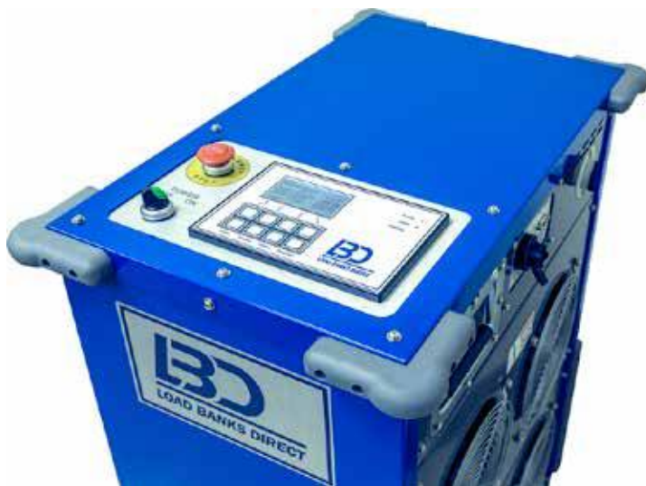
100KW Portable with top mounted Controller

Data Logger Access, Fault Diagnostics and Custom Configuration Setup are available from any screen.