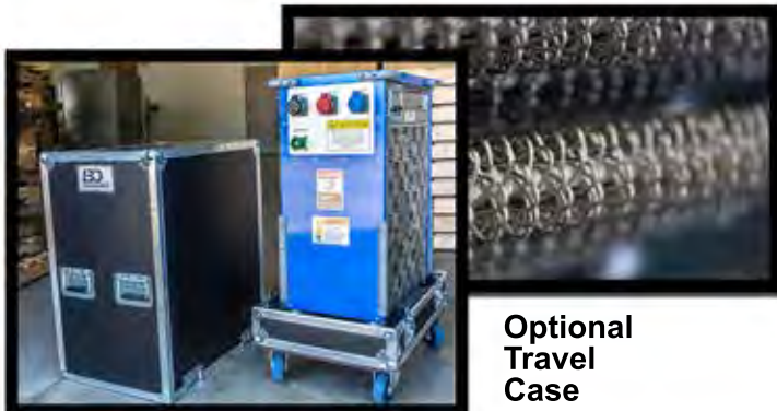
Optional Travel Case

PowerDyne™ Resistors are the most rugged in the industry and can handle the rigors of over-the-road use. They are fully supported across their entire length within the air stream by stainless steel support rods which are insulated with heavy-duty, high-temperature ceramic insulators. Load step stability is maintained by conservative resistor designs.