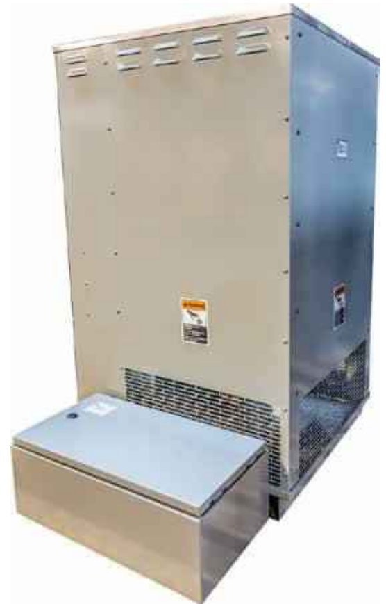
Custom Battery Simulator, 600VDC, 160KW shown here

LOAD BANKS DIRECT, LLC is a leading manufacturer of high-capacity Load Banks. The DC Series of Load Banks are designed for battery capacity testing & maintenance, acceptance testing, discharge testing and other testing for DC power systems. Common applications include telecommunication, data centers, utility and military. The DC Series is the perfect solution for regularly scheduled maintenance testing and commissioning of mission-critical DC power systems.